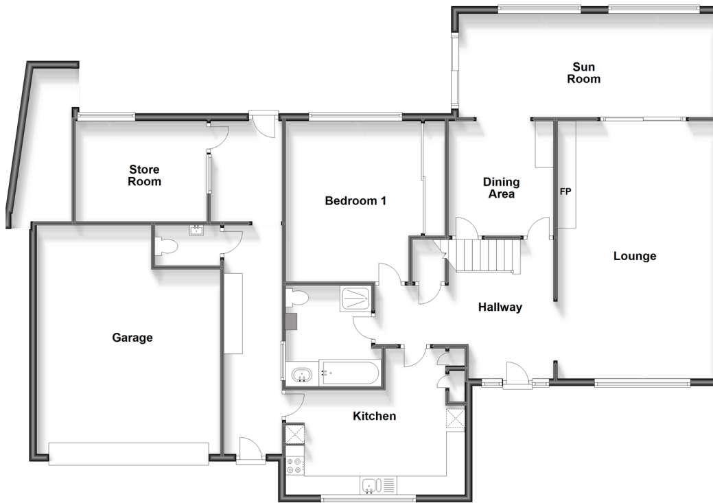
Ground Floor Approx. 178.2 sq. metres (1918.1 sq. feet)