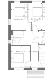
THE LAUREL First Floor House Total Area - 160.7sq.m / 1730sq.ft