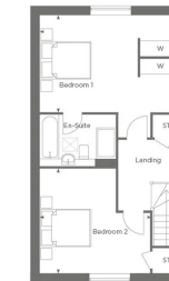
THE LAUREL Second Floor House Total Area - 160.7sq.m / 1730sq.ft

Call Whitstable - 01227 772272 ■ wardsofkent.co.uk