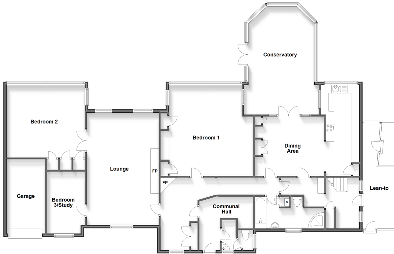
Ground Floor Approx. 211.6 sq. metres (2278.1 sq. feet)