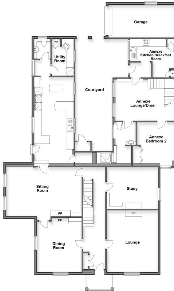
Split Level Ground Floor Approx. 187.6 sq. metres (2019.2 sq. feet)