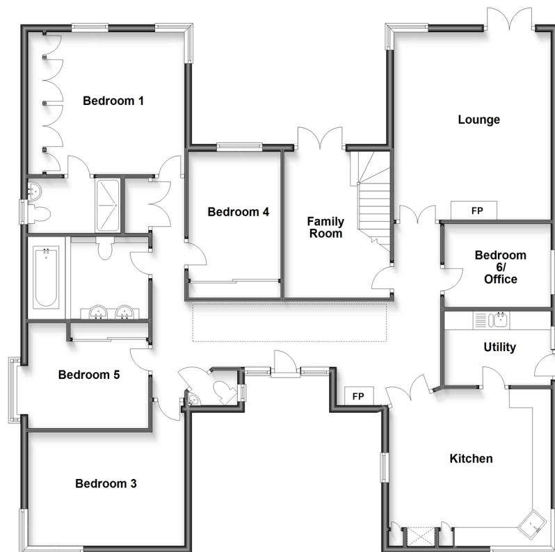
Ground Floor Approx. 154.3 sq. metres (1660.6 sq. feet)