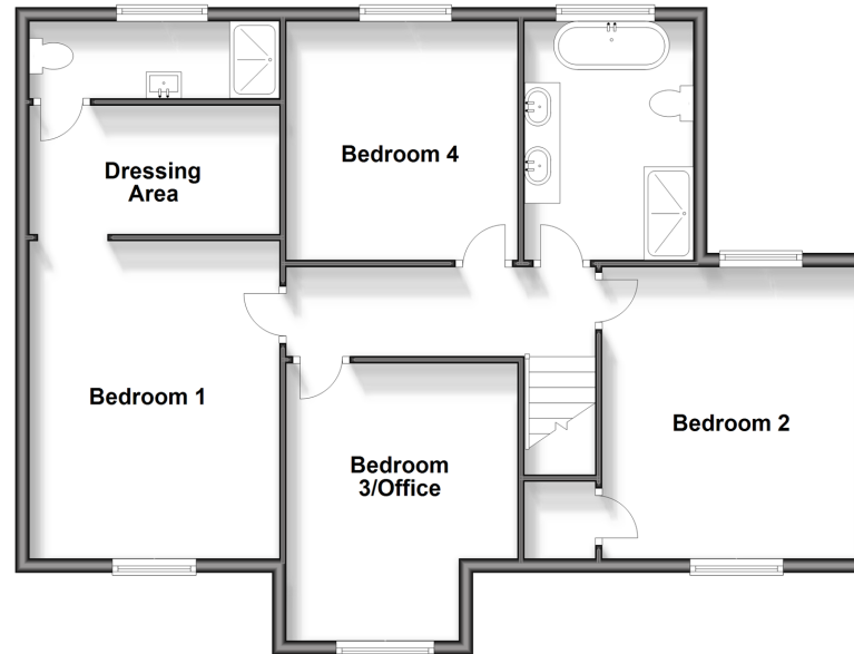
First Floor Approx. 83.9 sq. metres (903.4 sq. feet)